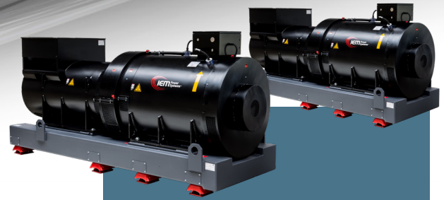
RBT-2000D-50 2000 kVA / 1600 kW