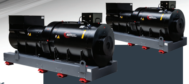
RBT-2750D-50 Hz 2750 kVA / 2200 kW