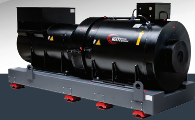
RBQ-1600-60 Hz 1600 kVA / 1280 kW